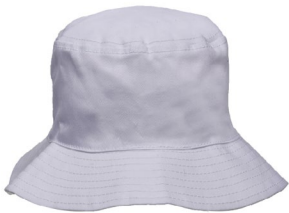
White sun hat with brim