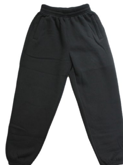
Black track bottoms