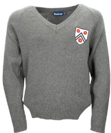
Grey v-neck sweater with school crest