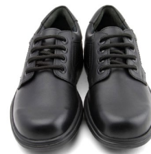
Black leather shoes with laces/velcro