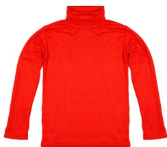
Red long-sleeve roll- neck shirt (winter)