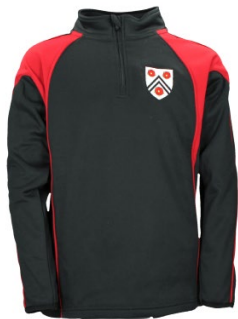
Red and black fleece