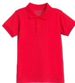
Red short-sleeve polo shirt (summer)