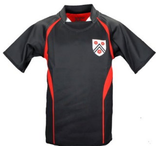
Fully reversible black/red rugby shirt (from Year 1)