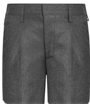
Grey shorts (optional for summer)