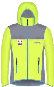
Hi-vis coat Provided by school