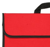
N.C.S. book bag