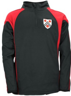
Red and black fleece