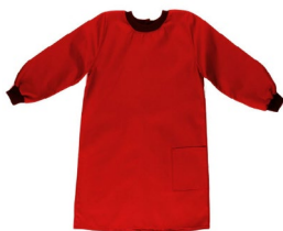
Art apron (velcro fastening)