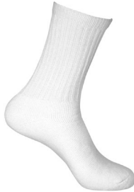
White sports socks