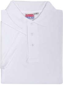
White polo shirt