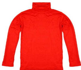
Red long-sleeve roll- neck shirt (winter)