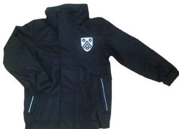
Black school/sports jacket with crest