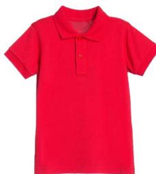
Red short-sleeve polo shirt (summer)