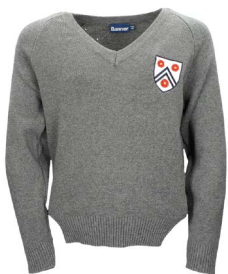
Grey v-neck sweater with school crest