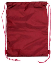
Drawstring sports bag