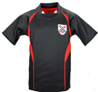
Fully reversible black/red rugby shirt (from Year 1)