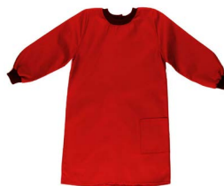
Art apron (velcro fastening)