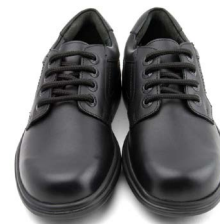
Black leather shoes with laces/velcro