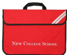
N.C.S. book bag