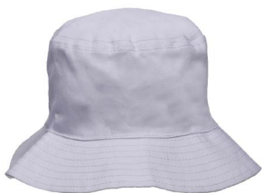
White sun hat with brim