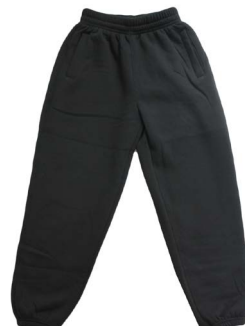
Black track bottoms