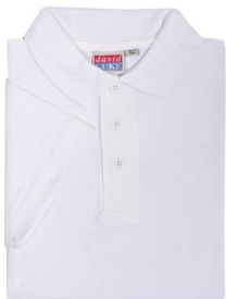
White polo shirt