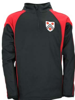
Red and black fleece