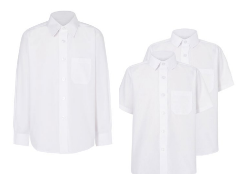
White long-sleeve shirt (short sleeves optional in summer)