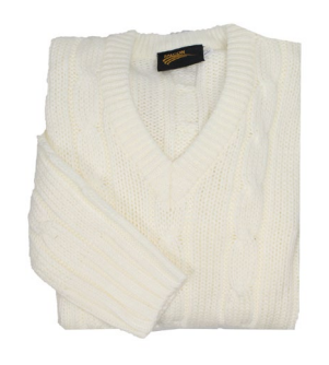
White v-neck cricket sweater