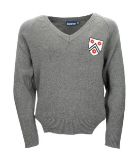
Grey v-neck sweater with school crest