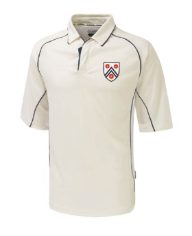
White cricket shirt