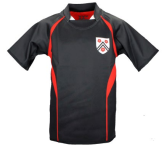
Fully reversible black/red sports top